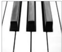
High ANSI Contrast

ANSI Contrast† is a way of measuring the true “real world” contrast performance you can expect from a projector in your own home. This measurement technique includes a reproducible procedure that can be used to compare the performance of projectors using different display technologies. With an ANSI contrast ratio significantly higher than many LCD based projectors, the HD67 is the only choice for Home Cinema purists that expect ultimate image fidelity in their home.