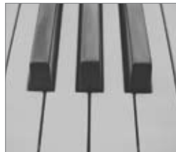
Low ANSI Contrast

Don't be misled by contrast ratio specs – a projector with a contrast ratio specification of, for example, 10,000:1 may well have an ANSI contrast ratio specification significantly lower than the HD67. Contrast ratio specifications are typically measured using a “Full On, Full Off” technique. This involves measuring the projector performance when displaying a pure black screen and then a pure white screen. Many believe that “Full On, Full Off” contrast measurements may not depict “real world” performance and may not offer the relevant information needed to determine how a projector will look when you are watching movies in your home. If you want to compare projector contrast specifications look for the ANSI contrast specification.